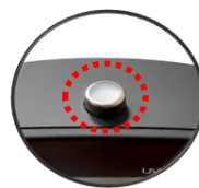
UV Detecting Sensor