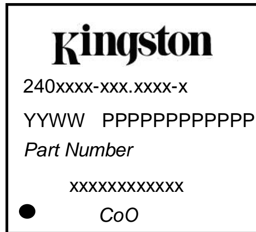
Figure 4 - EMMC Package Marking